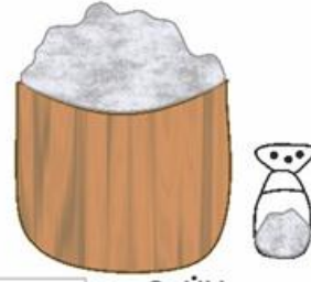
உப்பு Uppu (Salt)