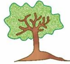
மரம் Maram (Tree)