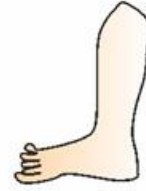
கால் Kaal (Leg)